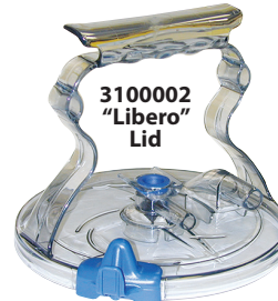
3100002 "Libero" Lid