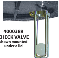
4000389 CHECK VALVE shown mounted under a lid