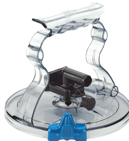
Libero Lid shown with 3100012 By-Pass Adapter available separately