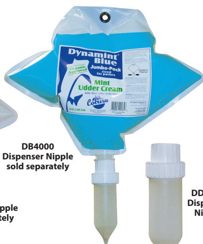
DB4000 Dispenser Nipple sold separately