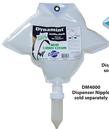
DM4000 Dispenser Nipple sold separately